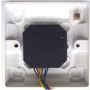
Internal wireless module