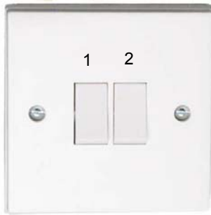
Wireless Wall Switch Part No. LS30060WSI